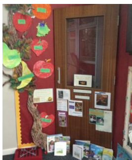
Windows, mirrors and doors display