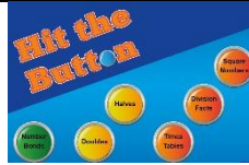
table option. If you keep a log of your scores you will see the progress of your recall.

Play on Hit the Button. Select the 12 times